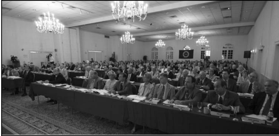
51 st Annual Round Table Conference • August 17, 2003

So I'd like to spend a little time taking your questions about this or anything else you would like to ask me and then maybe make a concluding remark.